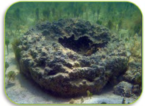
A healthy loggerhead sponge.

Because of their abundance and size, sponges play an important part in naturally functioning ecosystems. As the dominant filter feeding organism in these habitats, they play a critical role in cycling food resources. They also alter water chemistry by cycling nutrients, and provide essential nursery habitat for important commercial fishery species like spiny lobsters and stone crabs.