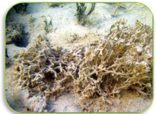
A loggerhead sponge after a die-off.