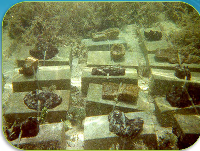
At left, preparing sponge transplants. At right, sponge cuttings healing before transplantation. Below, a healthy vase sponge.

Sponges are animals that are among the most visible residents of the hard-bottom habitats typical of the Florida Keys and Florida Bay. Some sponge species, like the vase and loggerhead, can grow to over 1 meter in diameter and live for decades if not longer.