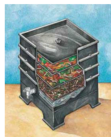
Store bought bins