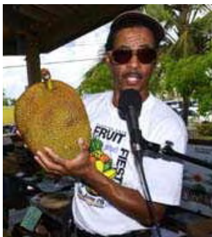
Bid on tropical fruit at the Fruit Auction

Extension programs and activities are open to all persons and do not discriminate with regard to race, creed, color, religion, age, disability, sex, sexual orientation, marital status, national origin, political opinions or affiliations.