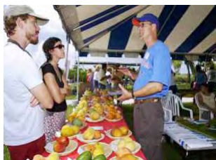
Tropical Fruit Basket